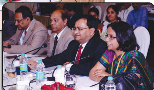
MD, REIL Director DHI and REIL team

The Company's guidelines and implementation of policies in relevance to the subject were shared during the meetings.