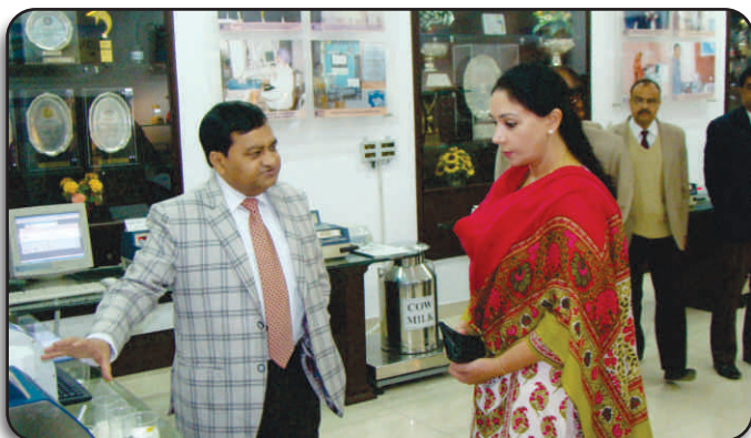
Smt Rajkumari Diya Kumari being briefed about REIL's solutions.

Smt. Rajkumari Diyakumari, MLA Sawai Madhopur visited REIL plant and witnessed the work being done by the Company on 14.01.2016