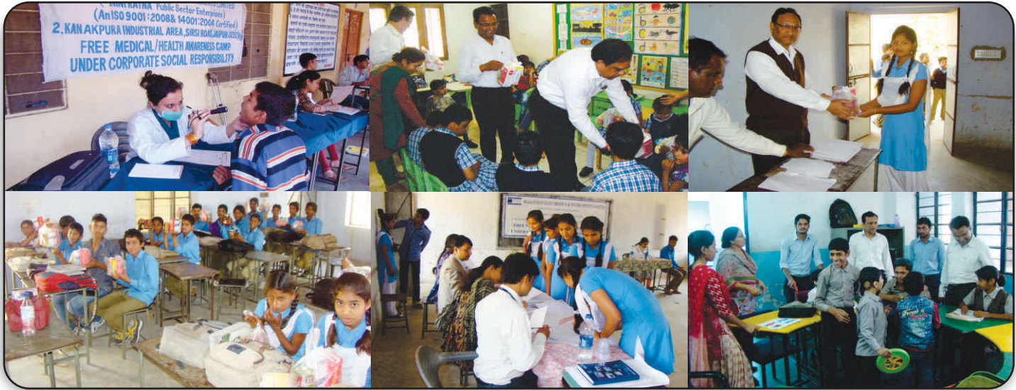
Medical camps at Government schools and NGOs and distribution of health kits to the students

Total 529 students in the age group of 06 to 38 years have been benefited in these camps.