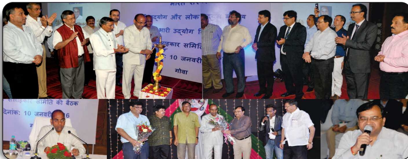
भारी उद्योग और लोक उद्यम मंत्रालय द्वारा आयोजित हिंदी सलाहकार समिति की बैठक के कुछ दृश्य