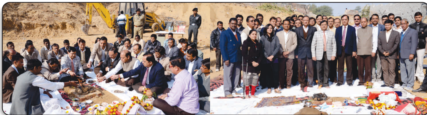
Glimpse of Bhoomi Pooja for new building for Information Technology, Education, Training, Research & Development Centre to be constructed at Mansarovar, Jaipur.