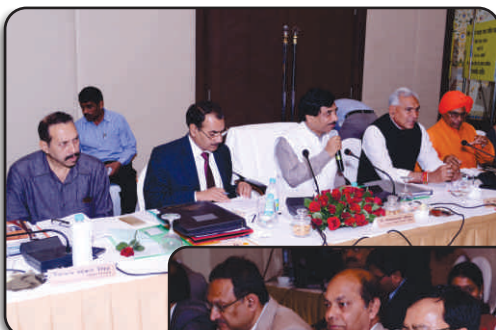
Parliamentary Committee Chairman and Members

Another Parliamentary Committee on Human Resource Development, presided by Dr. Satyanarayan Jatiya, Chairman, Member of Parliament, was held at Udaipur on 19.02.2016, wherein ' Promotion of sports and recruitment of sportspersons in REIL ' was discussed and deliberated by REIL officials.