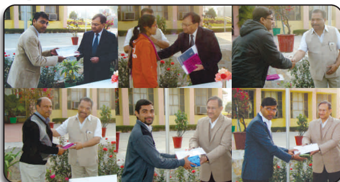
Winners of different competitions receiving awards

On this occasion Prizes & Certificates were given by Managing Director to the winners of "Vigilance Awareness and Anti-Corruption Slogan and Essay Competition - 2015"