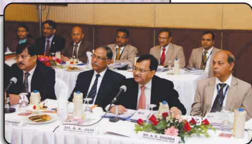
MD, REIL and team

Another Parliamentary Committee on Human Resource Development, presided by Dr. Satyanarayan Jatiya, Chairman, Member of Parliament, was held at Udaipur on 19.02.2016, wherein ' Promotion of sports and recruitment of sportspersons in REIL ' was discussed and deliberated by REIL officials.