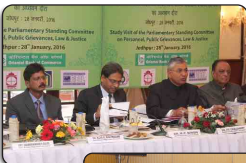
Parliamentary Committee Chairman and Members