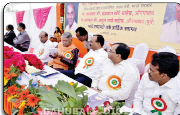
MD REIL with Hon'ble Minister, MoHI&PE, JS DHI, and other dignitaries during inauguration of Hi-Tech Machine Shop at HMT Aurangabad on 05.01.2016