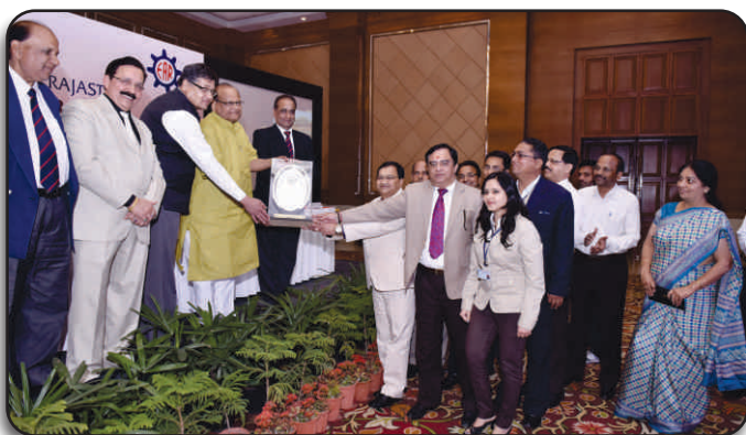
Best Employer Award 2014 to REIL on 25.02.2016

The Company received prestigious "Best Employer Award-2014", from the Employers' Association of Rajasthan (EAR), for 7 th time in a row for its good cordial industrial relations with the employees, Health and Safety Policy and effective Employees' Grievance Policy.