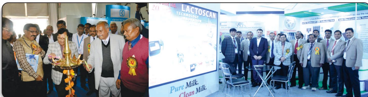
MD, REIL while lighting the lamp